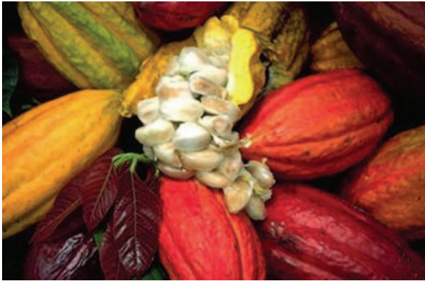
Figure 2. The fruit of the theobroma cocoa tree.

Therefore, careful distinction between in vitro and in vivo effects of flavanols is mandatory. For example, although procyanidins are biologically active in vitro , they are hardly absorbed in the intestine and thus are largely inactive in vivo .